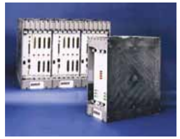
MicroNet TMR System

The local operating panel enabled the operators to control the system with the help of multiple switches, lamps and an analog indicator. The operator can choose to operate the turbine from either the local operating panel or from the Human Machine Interface (HMI). The local operating panel includes an annunciator displaying several alarms and shutdowns.