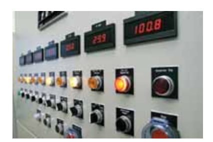
Local Operating Panel